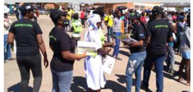
ZESN voter educators distributing newsletters and CVE material at a roadshow in Pumula Bulawayo

ZESN also took the opportunity to distribute its promotional campaign materials such as caps, wrappers and facemasks inscribed Register to Vote. A total of 6 000 copies of the Ballot Newsletter were distributed which contained stories on electoral reforms and delimitation of electoral boundaries among others.