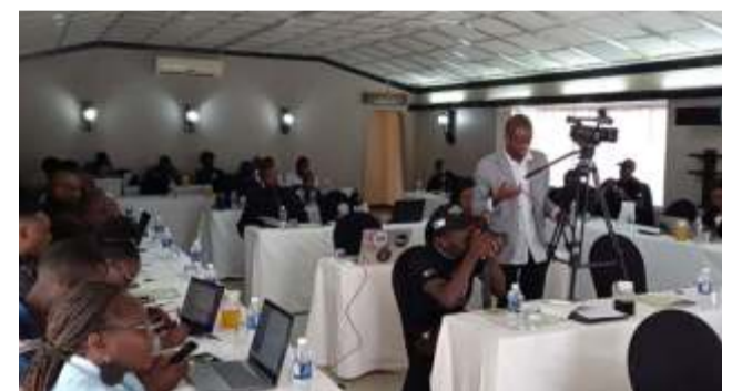
Some of the Participants at the Media Elections Academy

Further the Conference also deliberated on content analysis with regards to election reporting and advertising; Dimensions of Electoral Processes focusing on the coverage of Special Interest Groups by the media, in particular, women, persons with disabilities and youths; Safety and security of the media during election reporting.