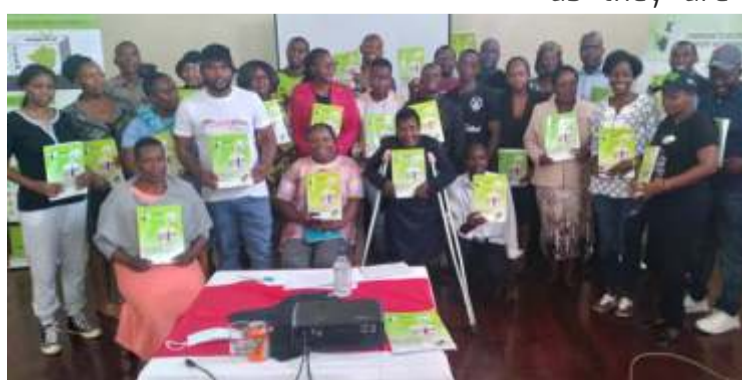
Bulawayo workshop participants