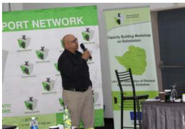
Regional Expert on Delimitation making a presentation based on South African Experiences

A Delimitation regional expert brought to the fore experiences from the South African Municipal Demarcation Board (MDB) and other best practices on delimitation from the region and beyond. In South Africa, the process is guided by geographical factors, communication and accessibility, topography, among other factors. Stakeholder consultation is part of the demarcation process and Zambia, Malawi and Mauritius are other countries in the region that have delimitation processes that are EMB led.