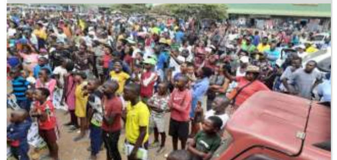
Part of the spectators at Murehwa Roadshow