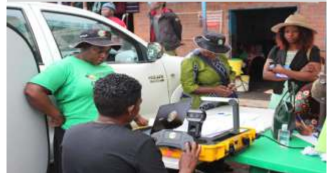
ZEC Personnel conducting voter registration on the sidelines of the ZESN Roadshow at Murehwa Centre.

As part ongoing civic engagement activities by the Zimbabwe Electoral Commission (ZEC), ZEC partnered with ZESN to offer Biometric Voter Registration (BVR) services onsite. ZEC managed to register more than 200 people onsite.