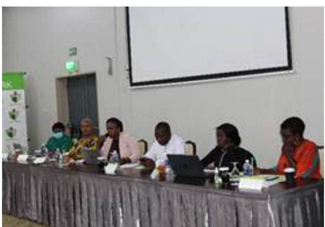
Panelists making submissions during plenary sessions

The Constitution provides for the number of constituencies and wards into which the country should be divided and the equality of voter's principle for constituencies, subject to the 20% derogation limit.