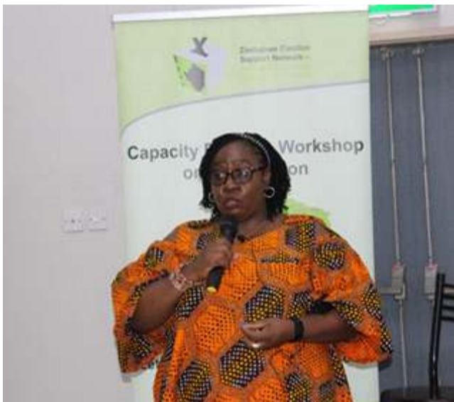
ZESN Programmes Director presenting on the Historical Background of Delimitation

Conference discussions focused on the Historical background of the process, its significance to electoral processes, legal framework, international best practices of Delimitation and an assessment of the process so far in Zimbabwe and proffered a way forward