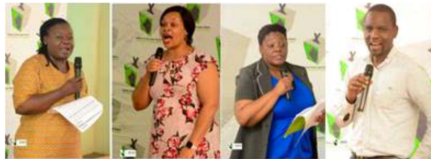
Representatives of cluster groups explaining their sections contained in the Strategy