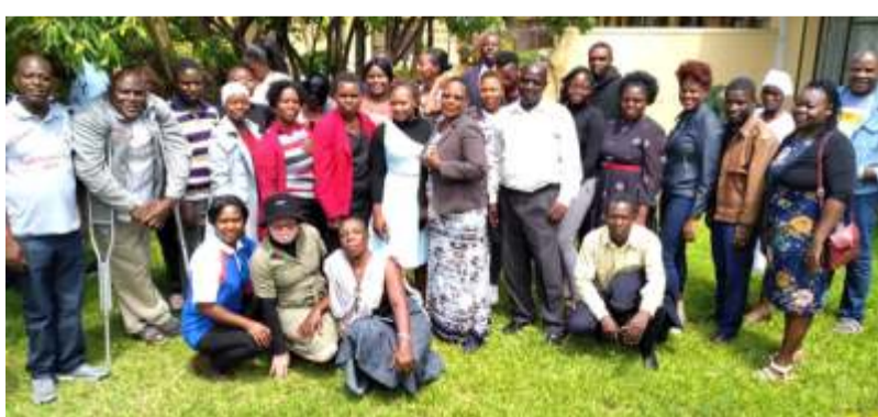
Masvingo workshop participants

The key observations drawn from the workshops were that; Elections are more legal than logical as they are conducted according to their provisions in the Constitution of Zimbabwe and the Electoral Act; The electoral cycle concept brought to the fore the continuous nature of the electoral processes.