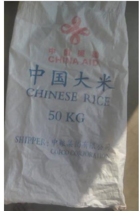
The ruling party campaign poster in use during the A sample of the 50kg bag of rice that was Chiredzi RDC Ward 12 by-election