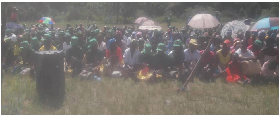
ZANU-PF supporters gathered at a rally at Masere Business Centre