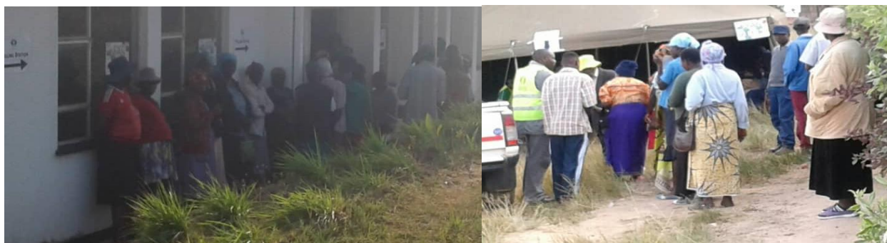
Queues of voters waiting to cast their ballots at Honde Mission (right) and Gombazikara Business Centre Tent (left)

It is encouraging that voter turnout was higher in this by-election than in other by-elections held earlier. The by-election recorded a 68% voter turnout. The long queues that were observed in the morning disappeared during the course of the day. More women than men were seen in the queues and youth turnout was particularly low when compared to other age groups. The overall turnout was however lower than the 86% voter turnout recorded in the harmonised elections.