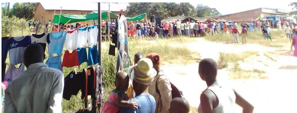
MDC Alliance supporters gathered at Masere Business Centre waiting for the rally to start

The pictures below show MDC Alliance and ZANU-PF supporters at rallies: