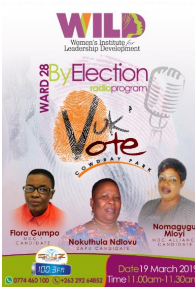
Figure 1: Flyers for a radio program that allows residents to interact with some of the women electoral contestants.

The pictures below illustrate some of the voter education efforts that are currently underway.