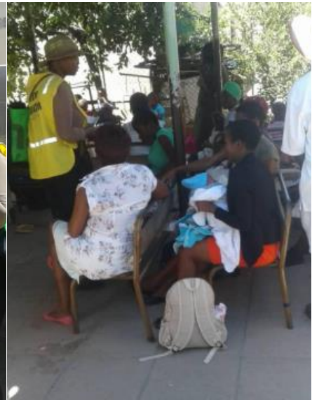
Figure 3: ZESN voter educators addressing residents in the ward