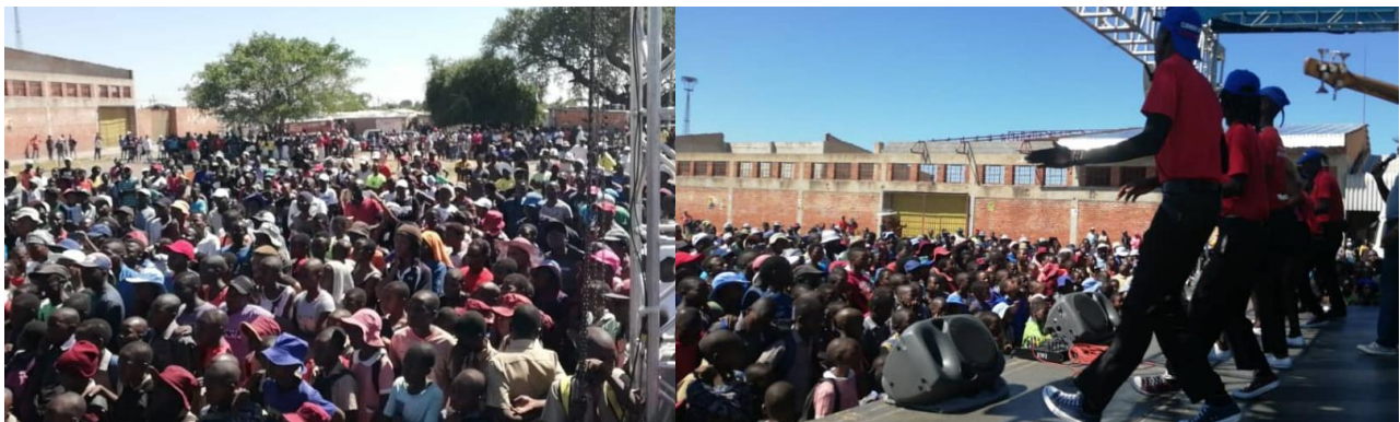
Figure 4: part of the crowd attending the voter education roadshows conducted by a Consortium of CSOs.