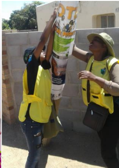
Figure 2: ZESN voter educators putting up voter education posters in the ward