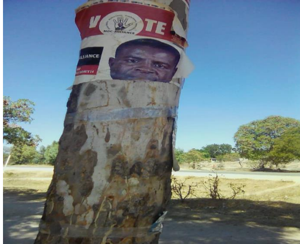
Torn Campaign Poster for the MDC Alliance Candidate

ZESN will continue to observe and report on developments and processes relating to the 24 November by-election in Mutoko North Constituency. The Network urges all political parties and their candidates and supporters to maintain a peaceful campaign environment and desist from committing any malpractices that may compromise the freeness, fairness, and credibility of the by-election.