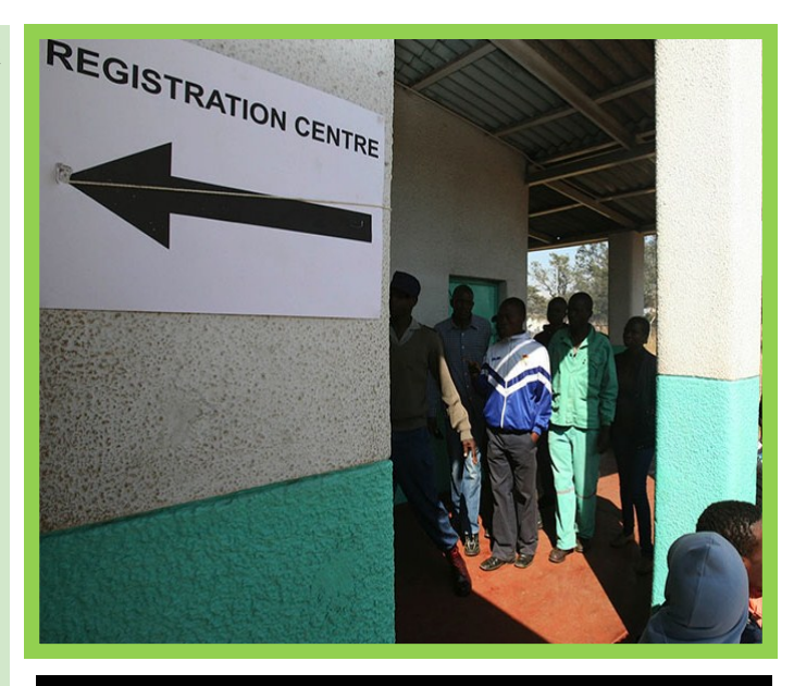
ZESN Observed the pilot voter registration exercise carried out by ZEC

two registration officers per centre while the Registrar-General deployed stationary and mobile teams to issue national identity documents, replace lost, torn or defaced documents among other services. These complimentary services provided by the Registrar General's office are welcome.