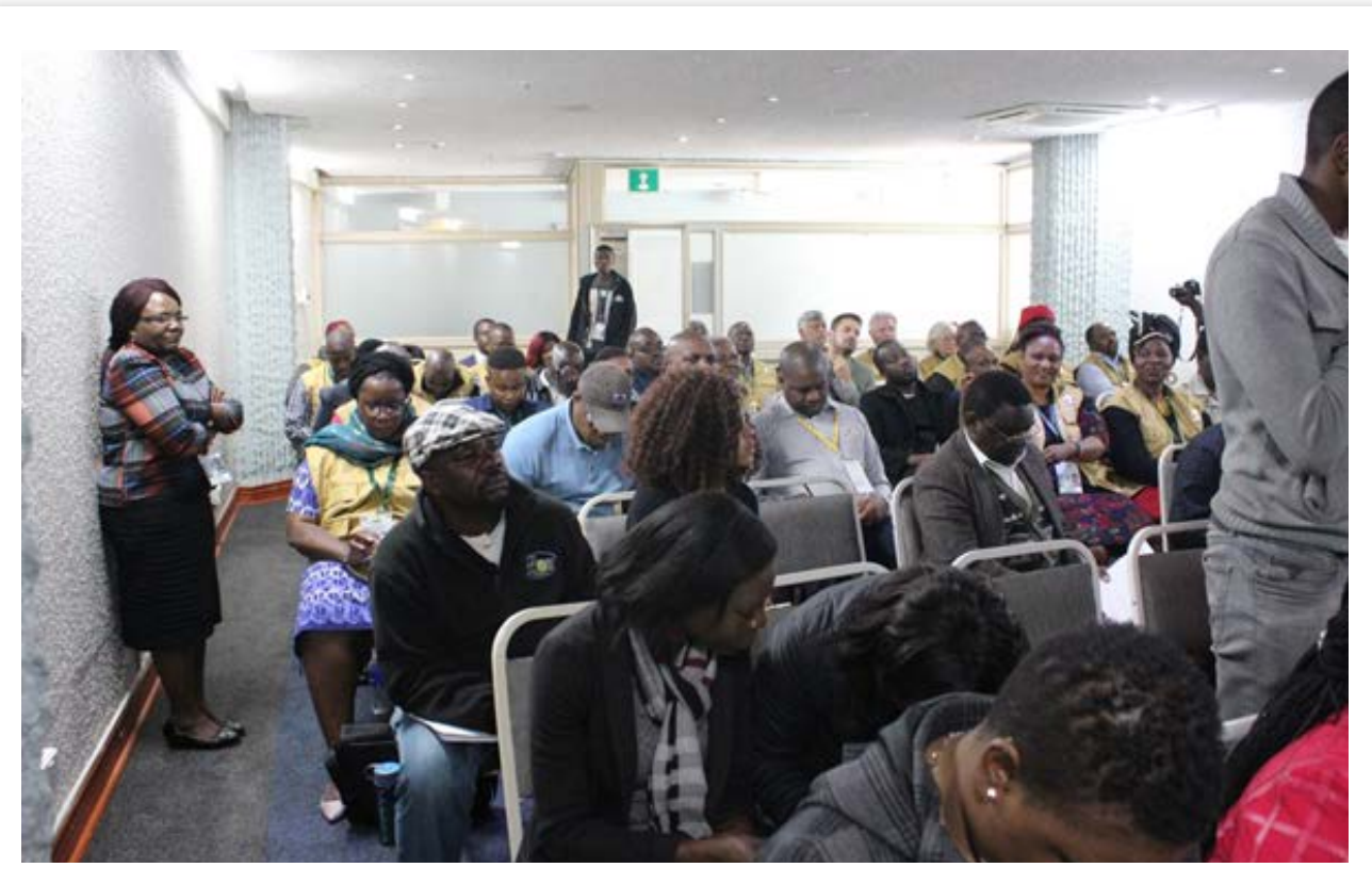
Snapshot of those who attended the Eminent Persons Observer Mission Press Conference on their Arrival Statement