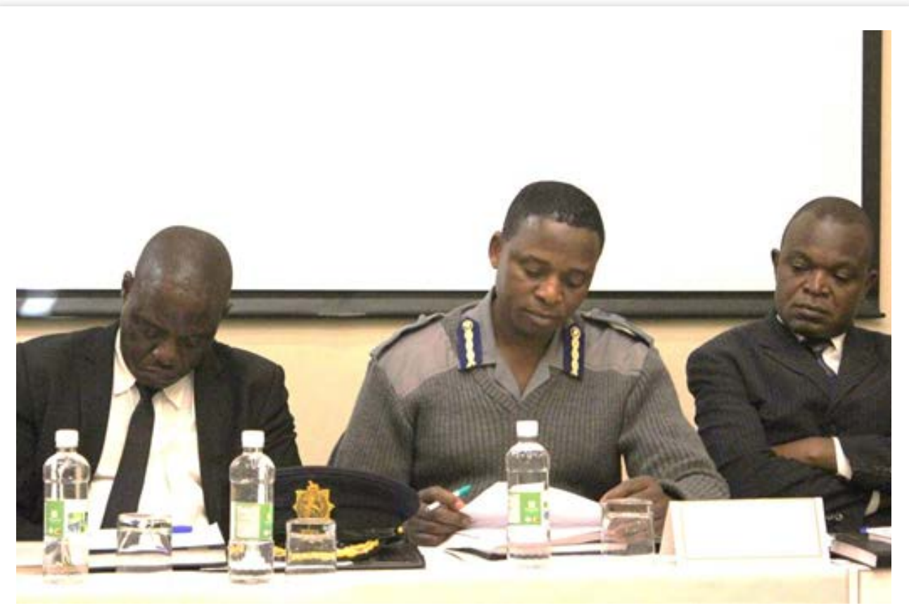
Briefing from the Zimbabwe Republic Police