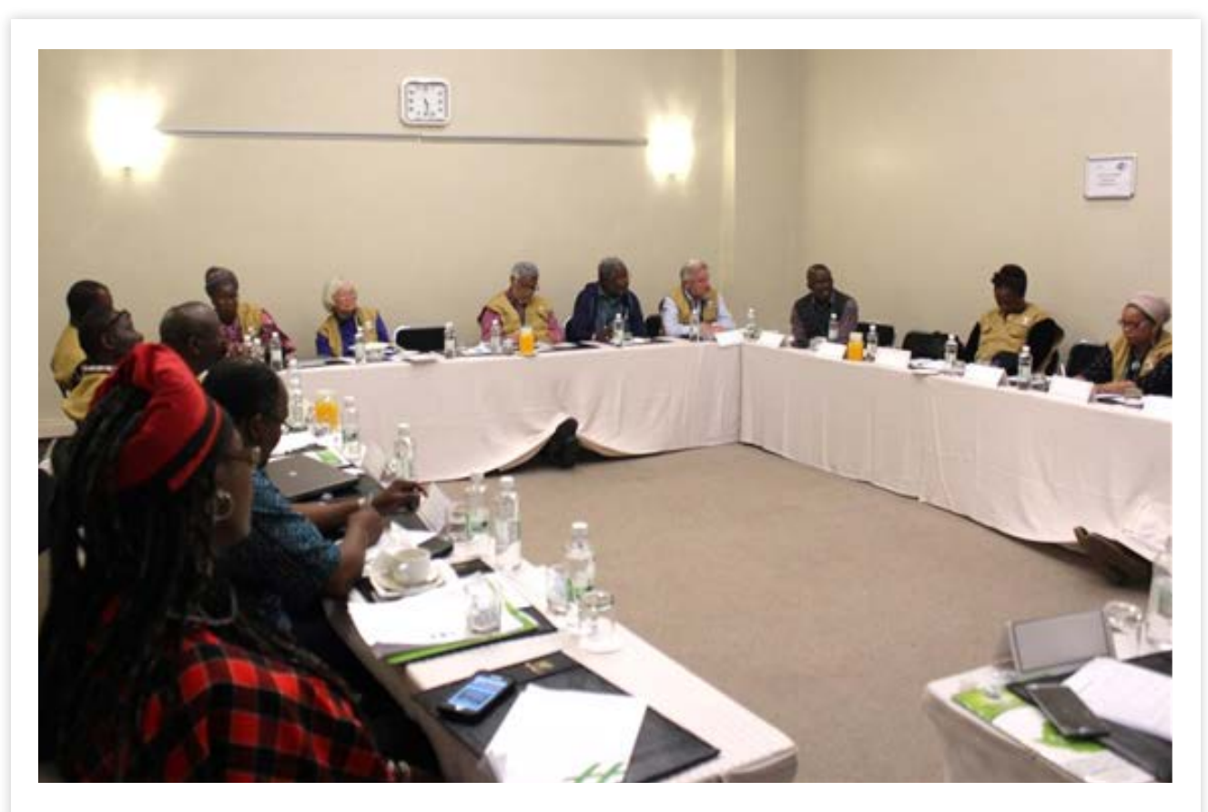
Post-election day de-briefing session