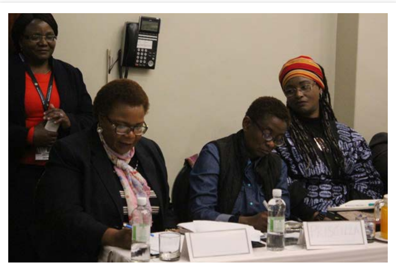
ZESN National Director Briefing the ESN-SA Observer Mission