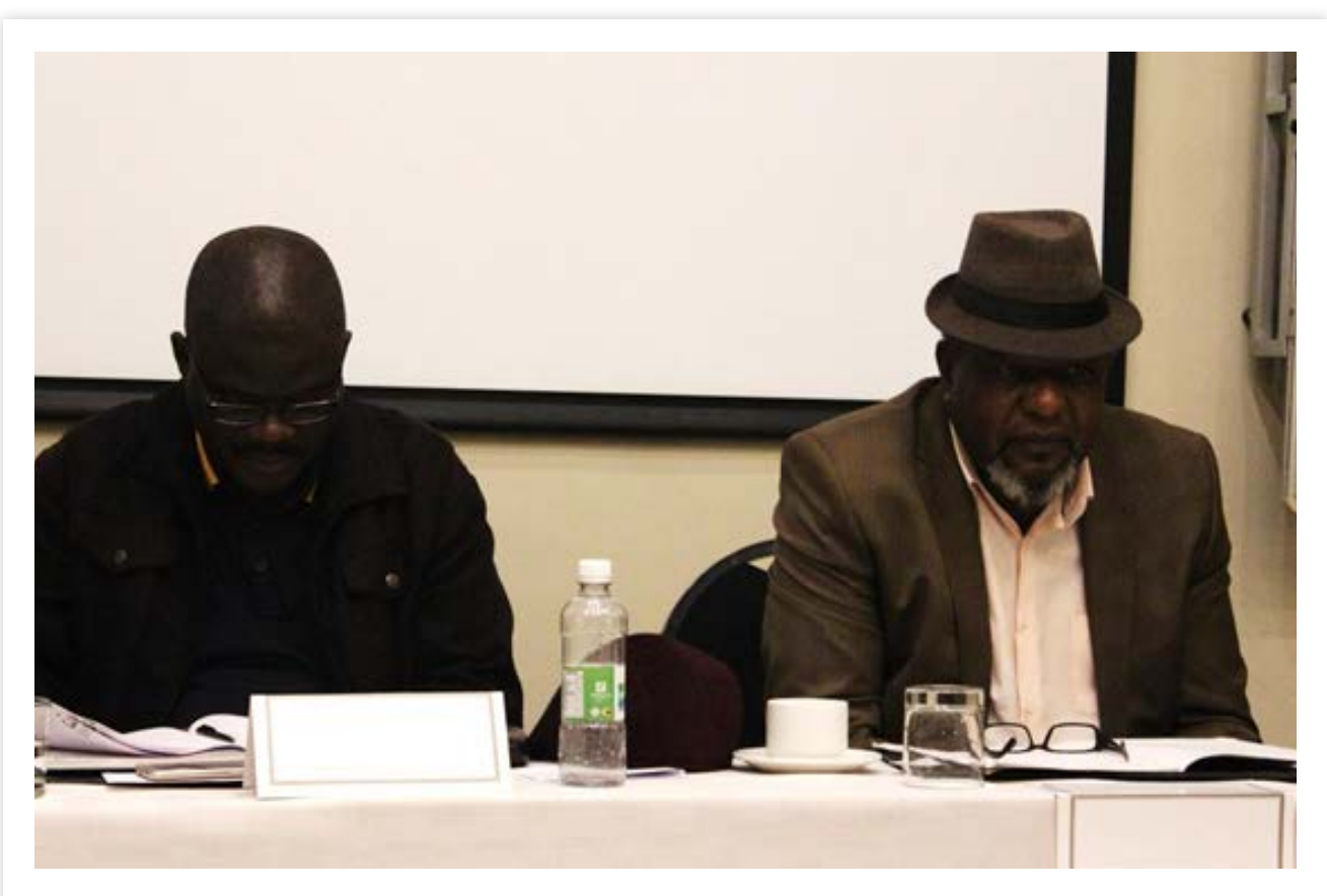
Briefing from representatives of the MDC Alliance