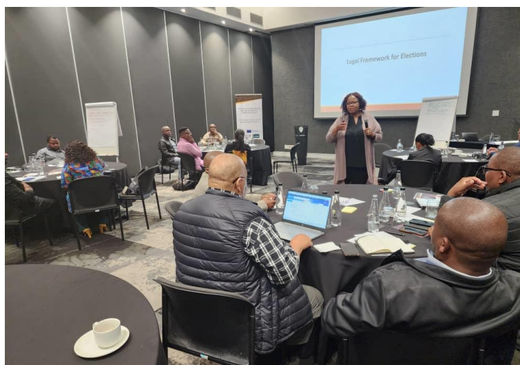
Picture 2: ESN-SA Host Executive Director presenting a session on the legal framework for elections

During the first day of the Academy various facets of the observation of electoral processes were covered in great detail. Under the topic, what is election observation? , various elements such as the reasons for election observation; the history of observation; the roles of international and domestic observers and the principles of observation; Election Observation Methodologies and approaches involved in short-term, long-term and sample based observation were discussed. The participants then broke into two (2) groups to brainstorm the scope of work and responsibilities of a long-term observer under the pre-electoral and post-electoral segments of the electoral cycle. Afterwards both groups presented their thoughts to the academy prompting in-depth discussions on the roles of long-term observers. To wrap up the day a highly insightful presentation on campaign financing was made covering the methods of observing campaign finances.